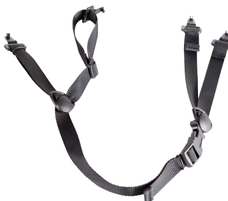
IH 000 001 000 4-point chinstrap with quick release buckle