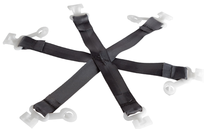
IH 000 100 020 6-point support tapes