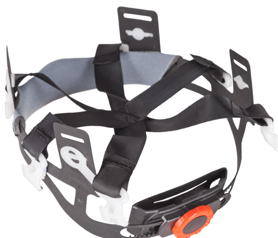
IH 000 200 000 fixed headband