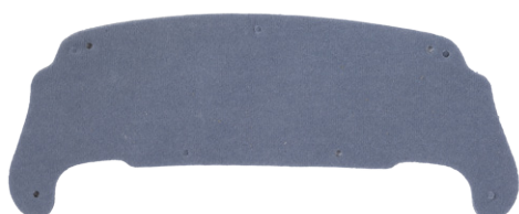
IH 000 100 080 velour sweatband