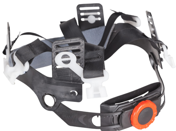
IH 000 100 000 rotatable headband