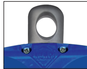
Swivel eye attachment point