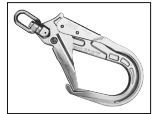
IKV 32W (ANSI Z.359.1-2007; CSA Z259.12-2011) with fall indicator