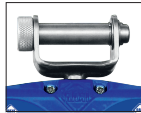
Swivel double action hooks (special swivel)