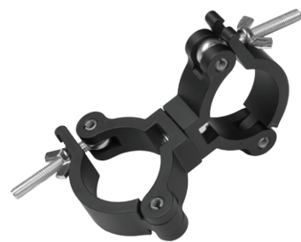
SPC pipe connector

When installing the device on irregularly shaped surfaces the use of chain or tape to connect the legs may be problematic. It is permissible to use bracing in the form of additional pipes with diameters from 48.3mm to 60mm connecting individual legs by means of rotating SPC pipe connectors .