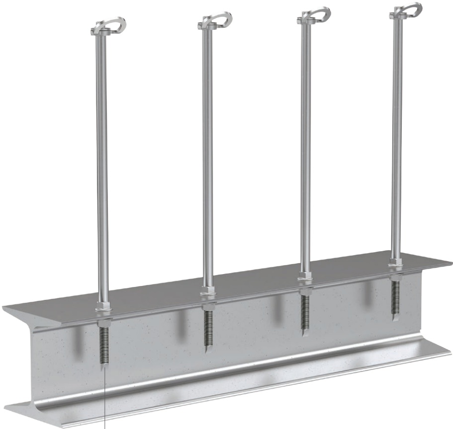
Assembly for steel structure